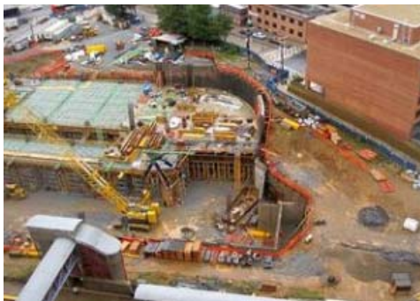
Construction of the Paul S. Sarbanes Silver Spring Transit Center is on schedule for an October 2011 opening. Upon completion, it will be one of the busiest transit centers in Maryland.